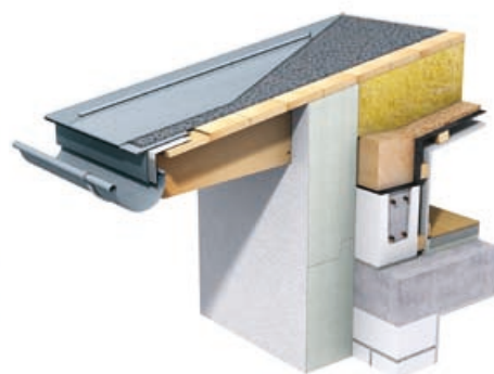
Fig. 2: Non-ventilated roof structure with full rafter insulation

Detailed information with examples of construction and relevant technical data for various applications are available from ourselves. If you would like to know more, please also see www.rheinzink.com/products